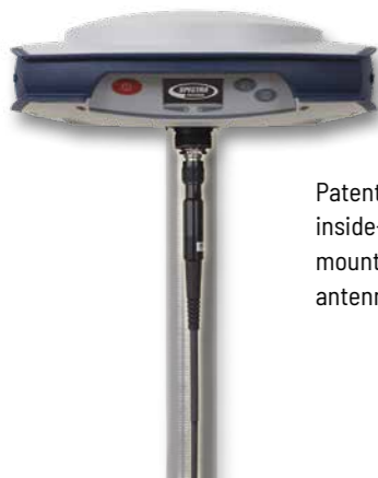
Patented inside-the-rod mounted UHF antenna design