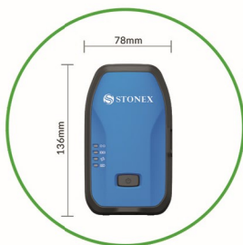
High precision positioning in a small space

Precision Farming, Mapping, GIS data collection, environmental agencies, forestry are just a short list of the fields where Stonex S500 will give a decisive impulse to the productivity and to the quality of the positioning data: and using the already existent devices, as Smartphones and Tablet with Android, iOS, Windows operating system.