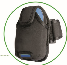
Hands free design