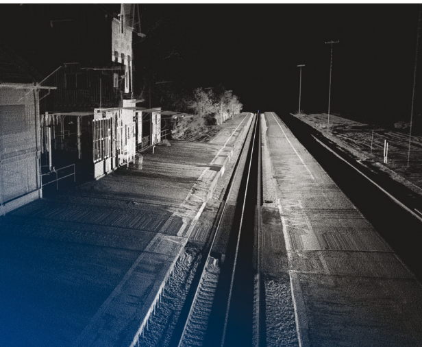
Sample data of the Wangen station captured within a few seconds

A hardware-assisted pixel-by-pixel synchronization, already used and tested in previous models, makes it possible to process external signals to determine the position of the scan data.