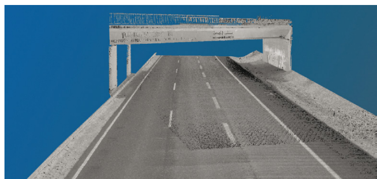
Sample data of a highway